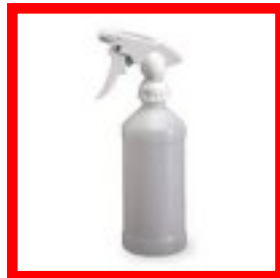
User Mixed Fire Retardant Fabric Spray Page 10-1