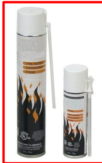
Expanding Foam Firestop – UL1479 Page 10-2